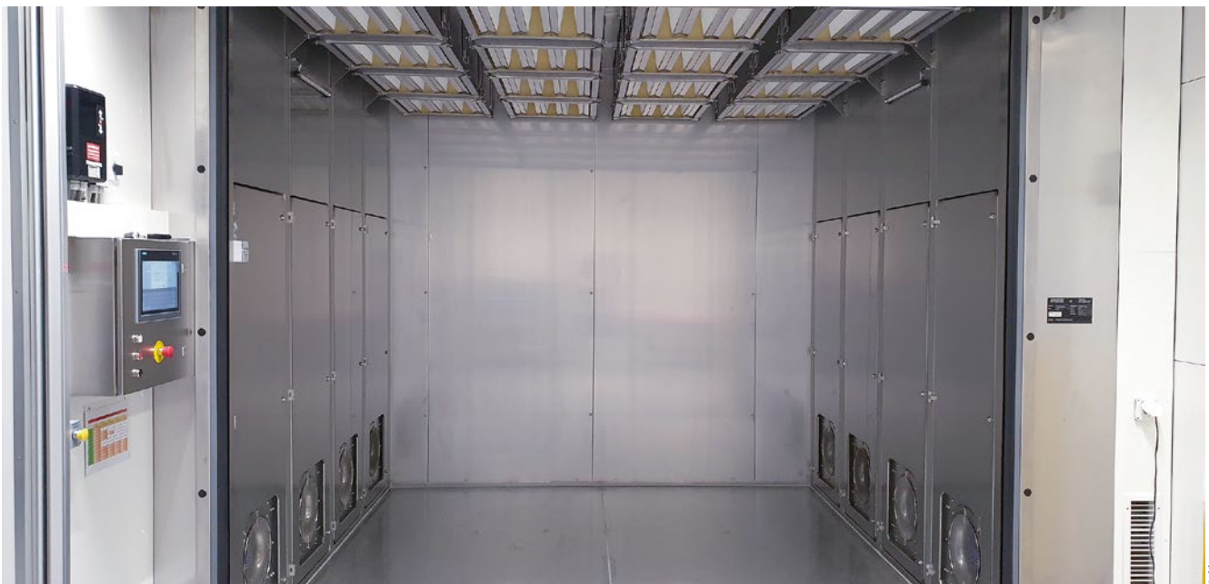
The cleaning capacity could be almost doubled by installing a separate large-capacity dryer.

Series of tests were conducted in Harter's pilot plant station to find the best solution. A test cube and a complex geometry aluminium valve housing in a plastic cleaning container were used for these tests. The components were first immersed in deionized water and then tested in two dryer set-ups with different air routing provisions. The operating parameters, such as temperature and time, were determined giving particular attention to high water entrapment sections. The