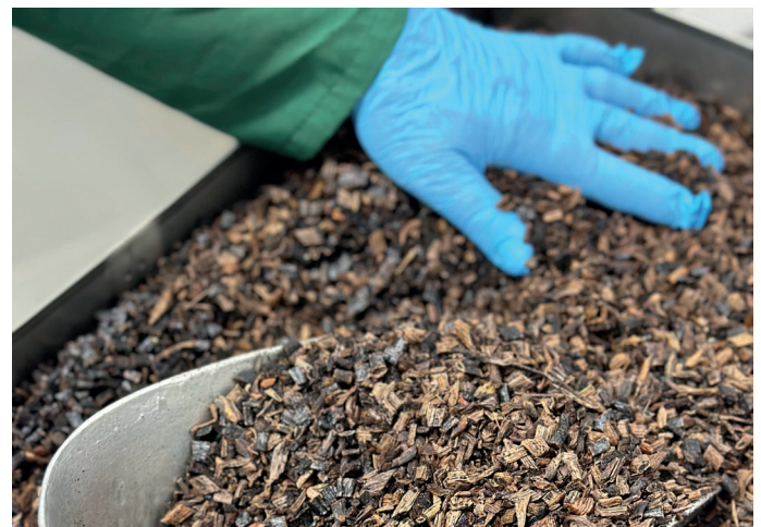
Vanilla chunks in fill heights of about 150 mm are uniformly dried at 75 °C.