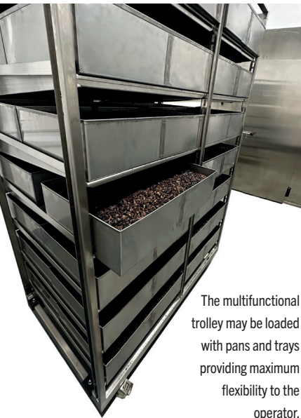
The multifunctional trolley may be loaded with pans and trays providing maximum flexibility to the operator.

air, and shuts off automatically later. Sensors installed at the entry and exit ends of the dryer are used to measure the temperature and humidity of the air. The system is controlled through an HMI panel in the control cabinet of the chamber dryer. The rated power of the drying system in production operation is about 15 kW.