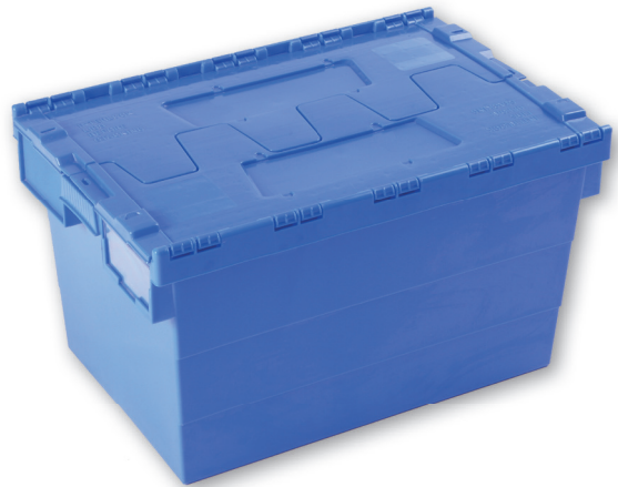
Fig. 3: The plastic boxes are processed at 75 °C to become completely dry within 40 min. Engineering creativity was required to cope with geometries that defied drying.

on the scene”, describes Specht the day-to-day situation as it presents itself to the drying system manufacturer. Testing was required because this job was very challenging, again. The 50 ml, 100 ml and 250 ml bags lie next to one another on trays with each batch including bags of the same size. 21 trays are stacked on a rack. Four of these racks each are sterilised at a time for 90 min.