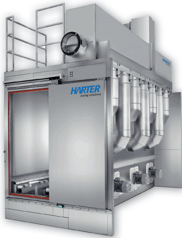
Fig. 4: Infusion bags are dried at 70 °C in this drying tunnel following spray water heating. While cooling and, sometimes, also temperature equalisation zones are integrated in other projects, such zones were not required here.

A heat pump module conditions the required process air – extremely dry and thus unsaturated air – and is also responsible for the condensation process. This enables complete drying, often faster than before. Low temperatures are gentle on the products, defined temperature limits provide process reliability. Constant parameters are ensured by the closed air system which is consequently exhaust-air-free. They provide independence from climatic conditions. Harter dryers may be used for batch or continuous operation. For quite some time, drying of whole cleanrooms or individual workplaces has also been part of the German company's portfolio. The highly efficient, power