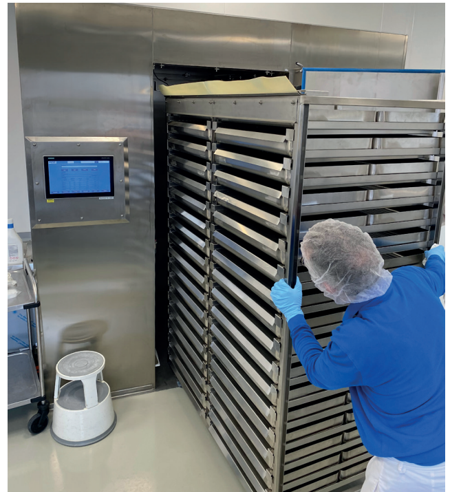
Fig. 1: Very diverse granulates for producing tablets are uniformly dried to obtain a defined residual humidity. The bulk height is 60 mm maximum.

Drying plastic boxes of a biotech company known worldwide was an entirely different application. The boxes are used for material handling. The plastic boxes are cleaned after use, dried and reused. „The operator used a combined cleaning-drying system of which the drying provision did not nearly get the job done“, reports Specht. „We see such situations very often und are then brought in as a problem solver.“ Ideally, manufacturers make themselves knowledgeable about the drying