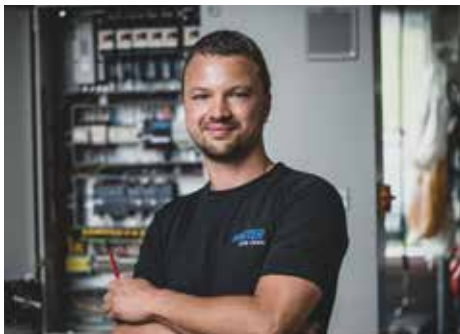
Control and Software