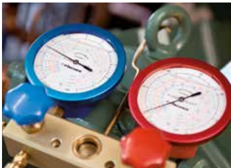
Acceptance/FAT, Assembly, Commissioning