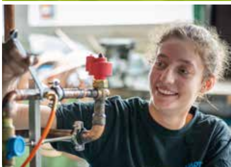
Refrigeration Construction / Heatpump